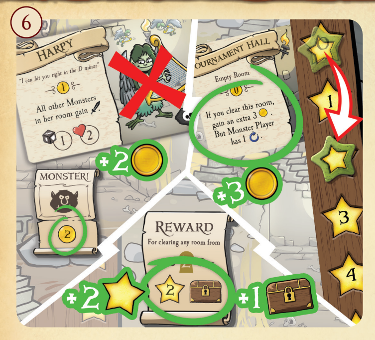
EXAMPLE 6: Regina defeated the Harpy, a Roaming Monster. The Reward, as shown on the Dungeon Board, is 2 Coins she immediately collects. Since she defeated all the Monsters in her Room (Roaming and Threat), she has also Cleared the Room!

She collects the Reward for Clearing a Level-2 Room: 2 Fame (she moves her token 2 spaces on the Fame-O-Meter) and 1 Loot