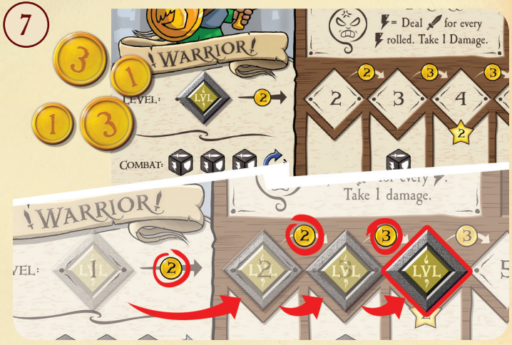
EXAMPLE 7: Regina has a total of 8 Coins. Time to seriously level up her Warrior! She spends 2 Coins to level up from 1 to 2, 2 Coins to reach Level 3, and 3 Coins to level up to Level 4! Her Warrior now has 1 extra die to roll in combat and 1 extra Health.

card (drawn from the Available Loot Area). The Alpha Gamer Helmet is there for the taking, and Regina could use an Armor Loot, so she takes and equips it. Finally, because she Cleared the Tournament Hall, she gets 3 Coins due to the Room's special Effect.