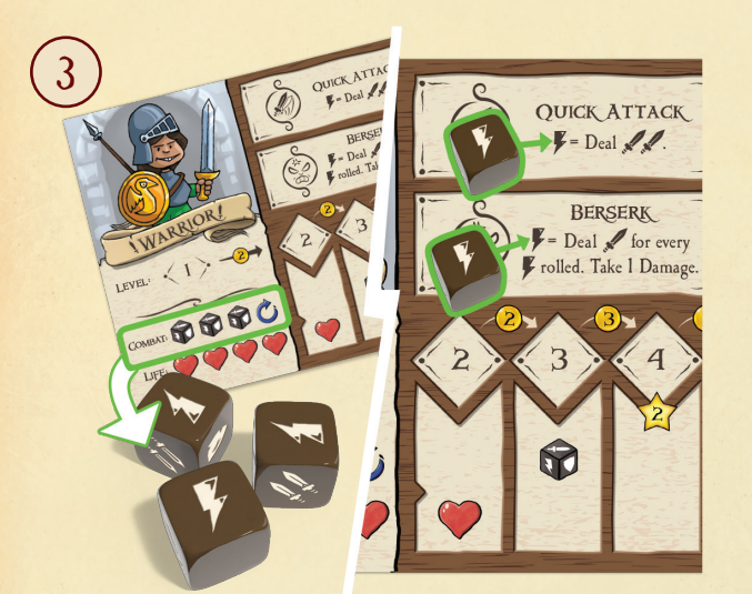
EXAMPLE 3: Regina is facing 2,783 Orcs plus an Enraged Harpy with her Level 1 Warrior. She rolls 3 dice and has 1 reroll. Regina rolls the dice and the results are 3 \checkmark ! She has only 2 Hero Powers to activate. She rerolls the 3^{rd} die and gets a \checkmark !