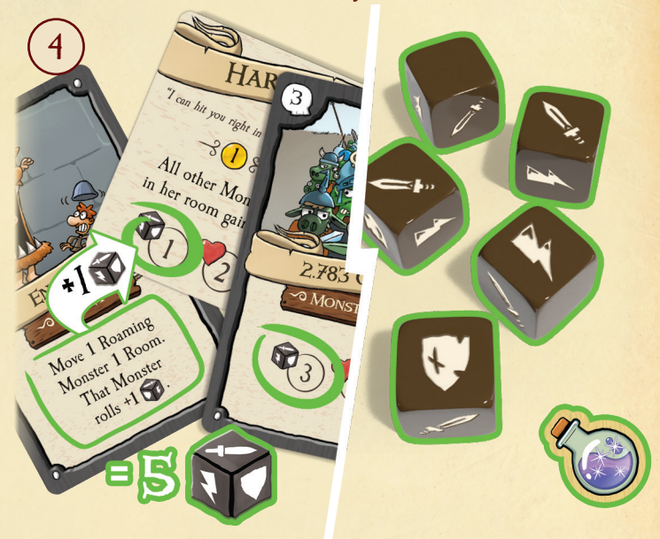
EXAMPLE 4: Marie rolls a total of 5 dice: 3 for the Orcs and 2 for the Harpy (the original single die plus the Enraged! additional die), and gets \mathscr{A} + \mathscr{A} + \mathfrak{P} + \mathscr{P} , and 1 blank. Thanks to the Harpy's ability, it also gets an automatic \mathscr{A} . Since neither the Orcs nor the Harpy have Powers that can be activated with \mathscr{P} , the Monsters have scored 3\mathscr{A} and 1 \mathfrak{P} .

By activating both her Hero Powers, she is getting 5 total Hits (2 from Quick Attack, 2 from Berserk, 1 from her \swarrow roll) and takes 1 Damage for using Berserk. In order to improve her odds of winning, Regina decides to spend a Potion token to roll 1 extra die: she rolls a \heartsuit ! It's Marie's turn to roll the dice for the Monsters.